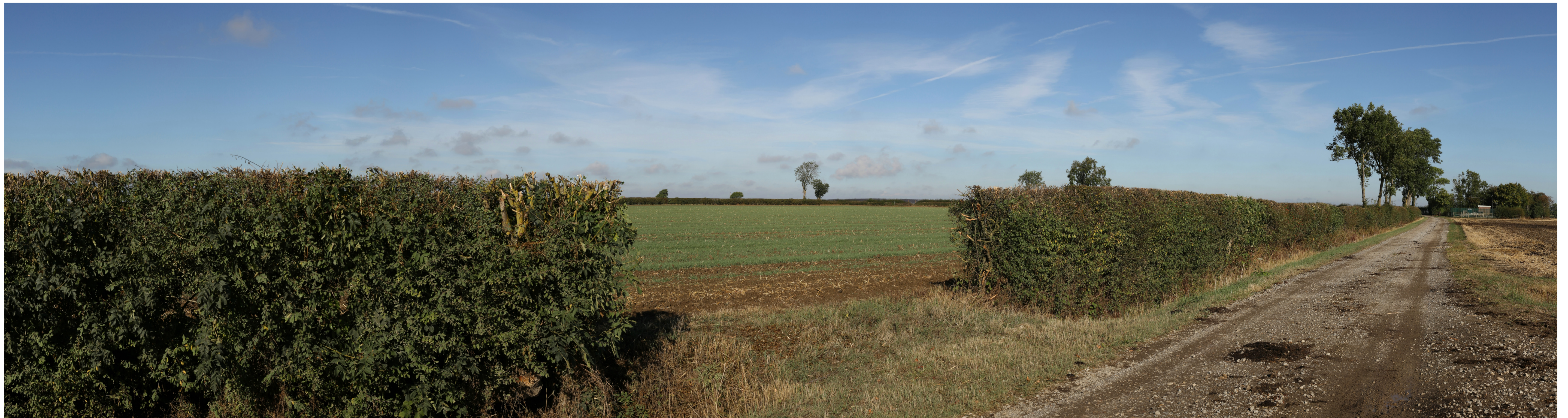
Proposed View Year 1 Distance to Nearest Order Limits 238m

Viewpoint LCC VP01 View northwest from PROW Stow/70/1 Print Size A1