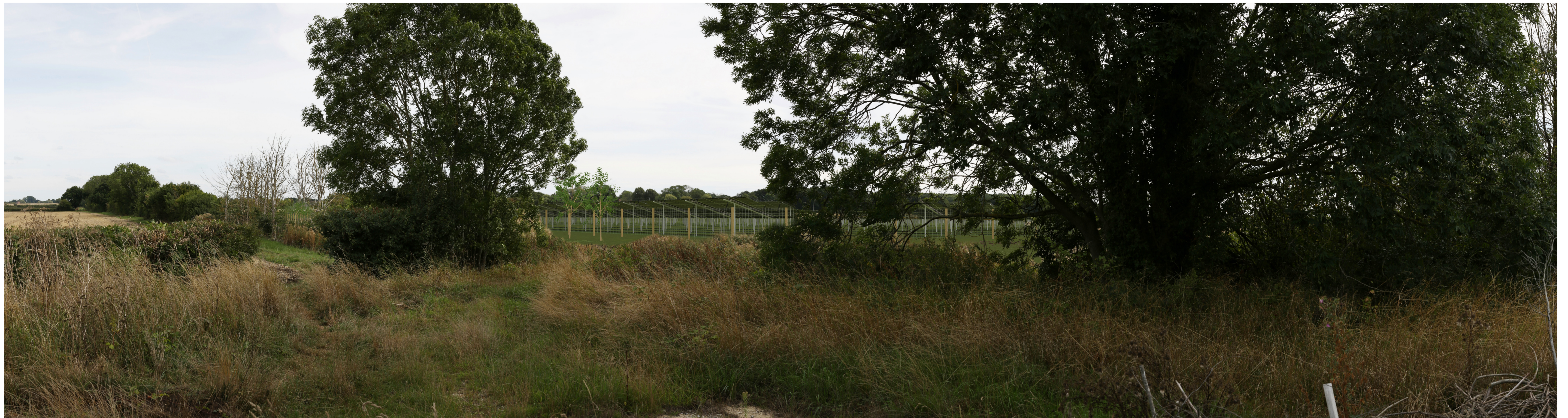
Proposed View Year 1 Distance to Nearest Order Limits 36m